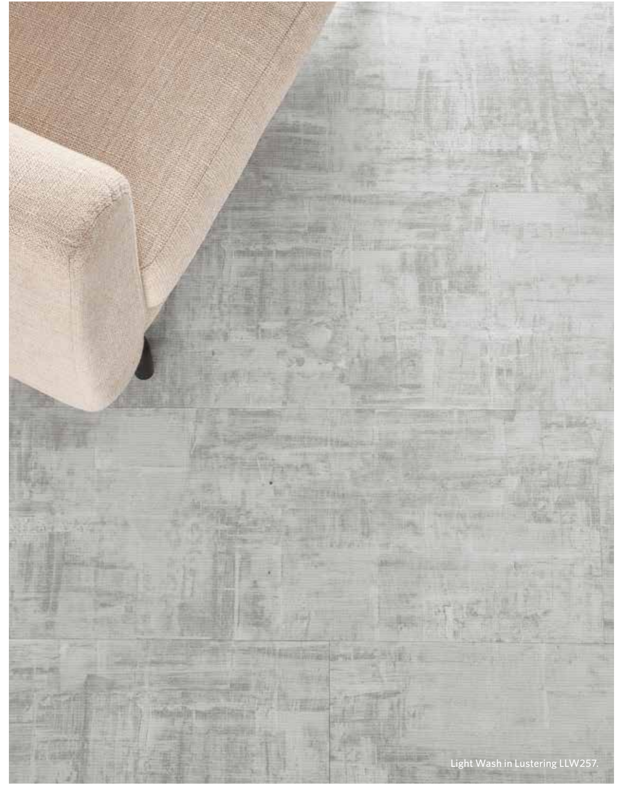
LIGHT WASH ——