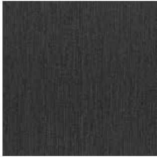
ISOGRAD ASH BLANKET IGD119-27