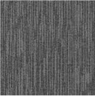
ISOGRAD ESKER IGD13-119