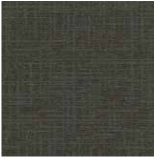
TECTONIC LAHAR TTC67-59