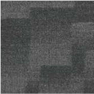
HIDDEN PLAINS ESKER HDP13-119