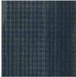
VIEWFINDER ZOOM VF218