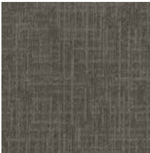
TECTONIC SPIRITLAND TTC122-120