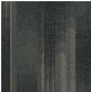
PANORAMIC VIGNETTE PA117