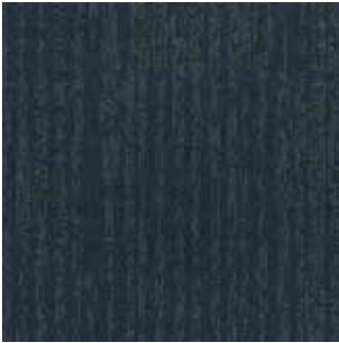
PINHOLE ZOOM PH418