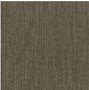
TECTONIC SANDPIPER TTC124-94