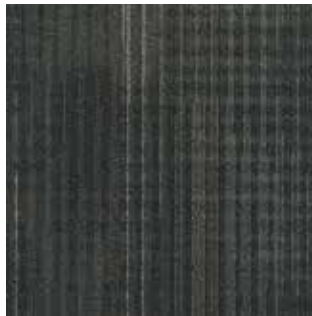
VIEWFINDER VIGNETTE VF217