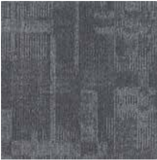
FACADE OBSCURA FAC13-118