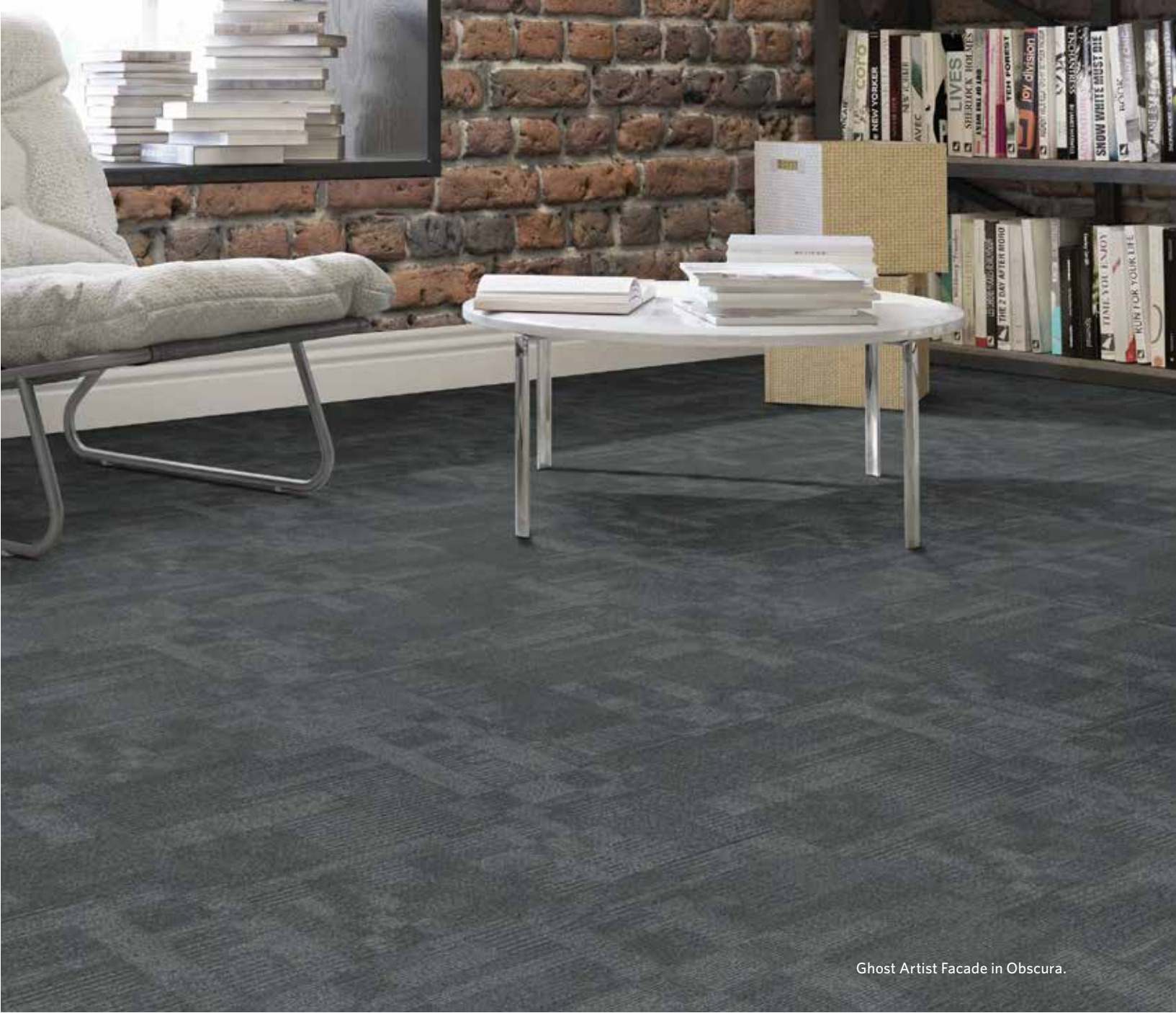
Ghost Artist Facade in Obscura.