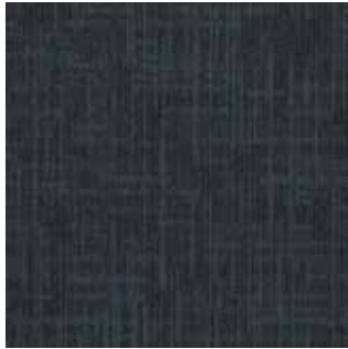
TECTONIC ROCK POWDER TTC27-52