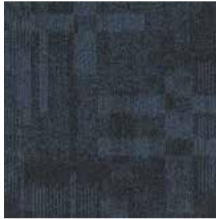
FACADE STEALTH FAC27-52