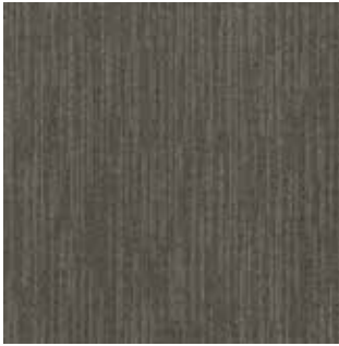
ISOGRAD SPIRITLAND IGD122-120