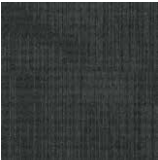
PINHOLE VIGNETTE PH417