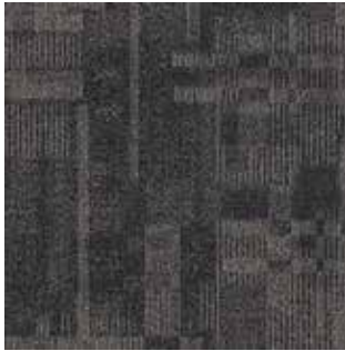
FACADE CONCEAL FAC133-120