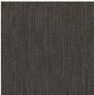
ISOGRAD LAHAR IGD67-59