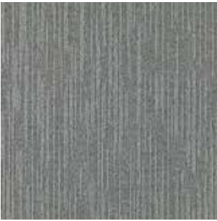
ISOGRAD FJORD IGD108-13