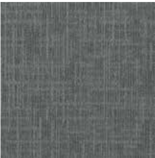
TECTONIC FJORD TTC108-13