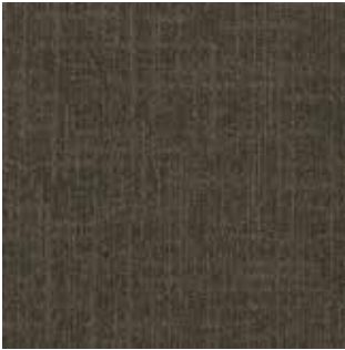
TECTONIC NORSE TTC94-59