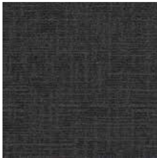
TECTONIC ASH BLANKET TTC119-27