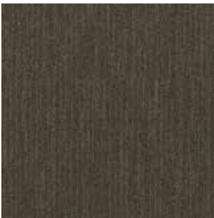
ISOGRAD NORSE IGD94-59