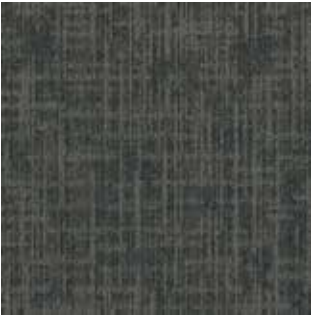
TECTONIC ESKER TTC13-119