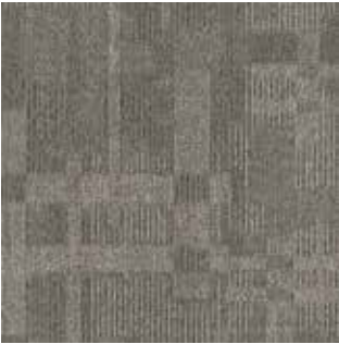
FACADE CLOAK FAC122-120