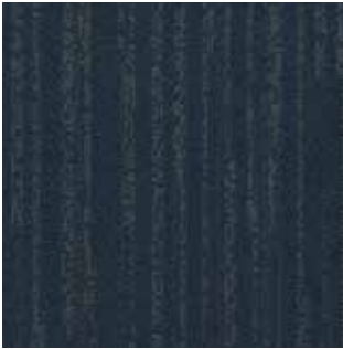
VOLTAGE ZOOM VT318