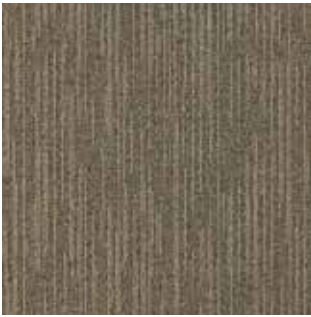
ISOGRAD SANDPIPER IGD124-94