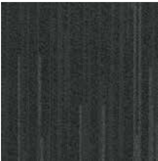
VOLTAGE VIGNETTE VT317