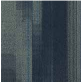
PANORAMIC ZOOM PA118