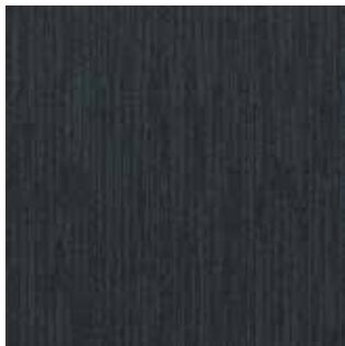
ISOGRAD ROCK POWDER IGD27-52