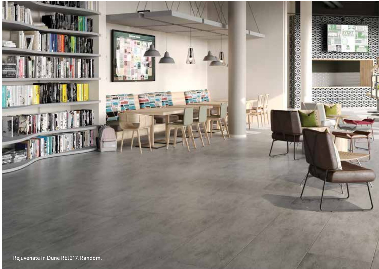
Rejuvenate in Dune REJ217. Random.