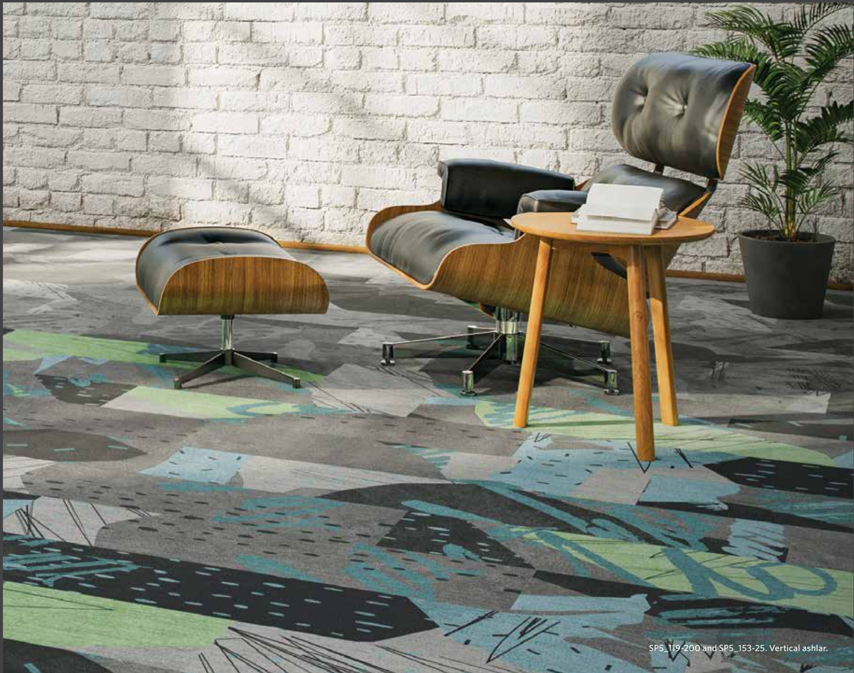
SP5_119-200 and SP5_153-25. Vertical ashlar.