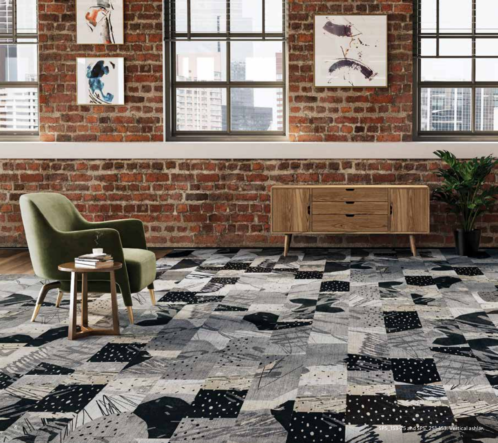
SP5_153-25 and SP5_251-153. Vertical ashlar.