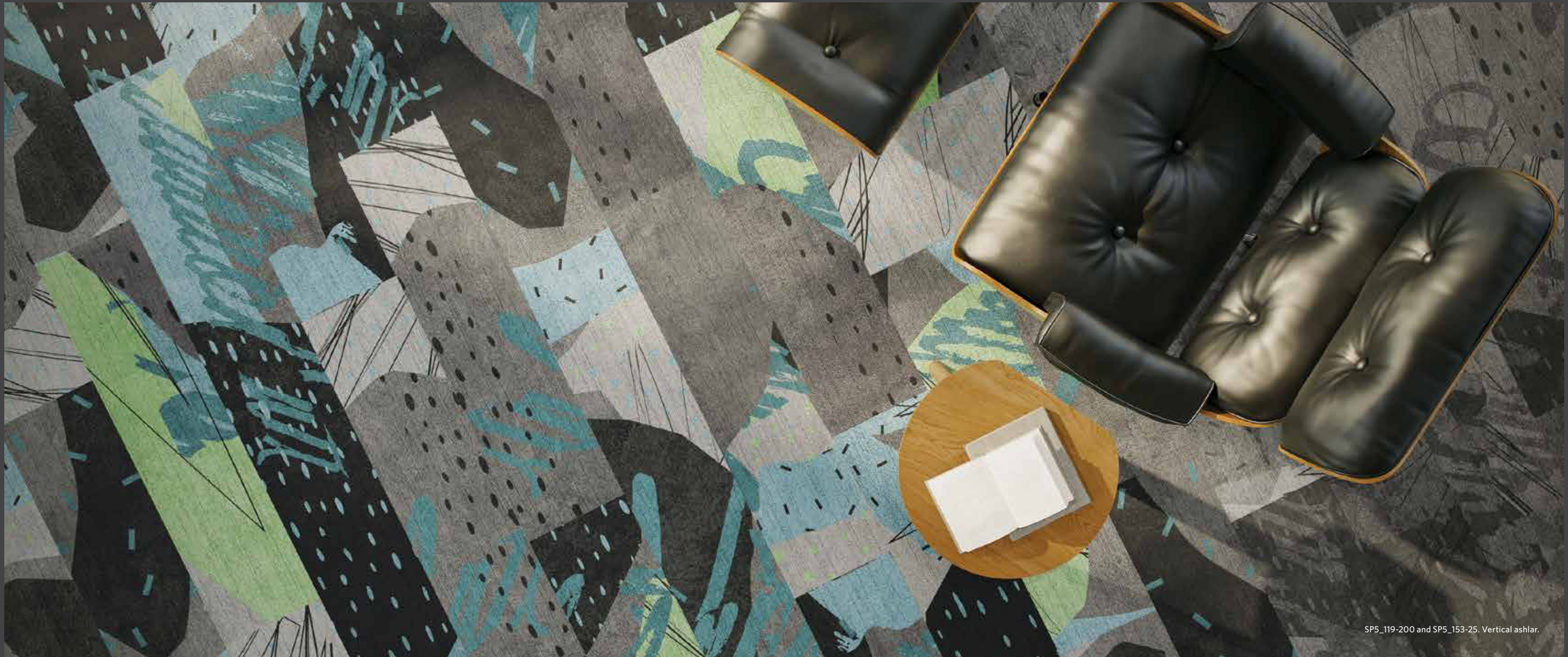
SP5_119-200 and SP5_153-25. Vertical ashlar.