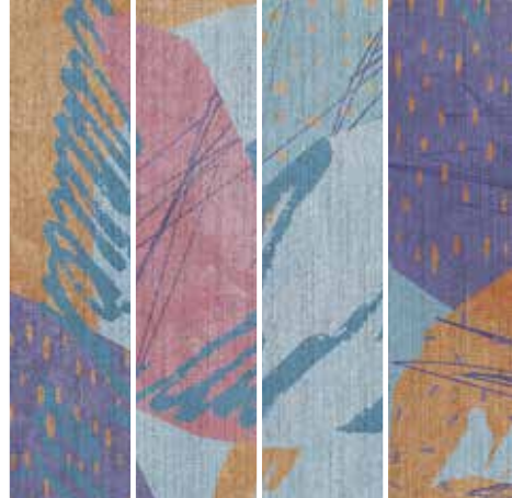
SP5_128-151 25 cm x 1 m planks