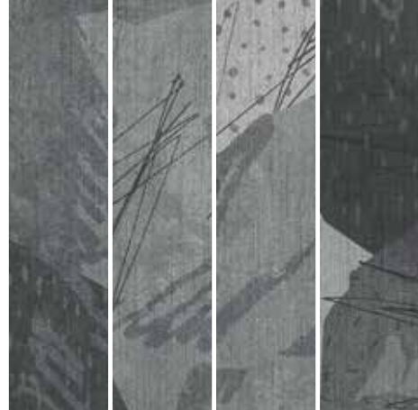
SP5_153-25 25 cm x 1 m planks