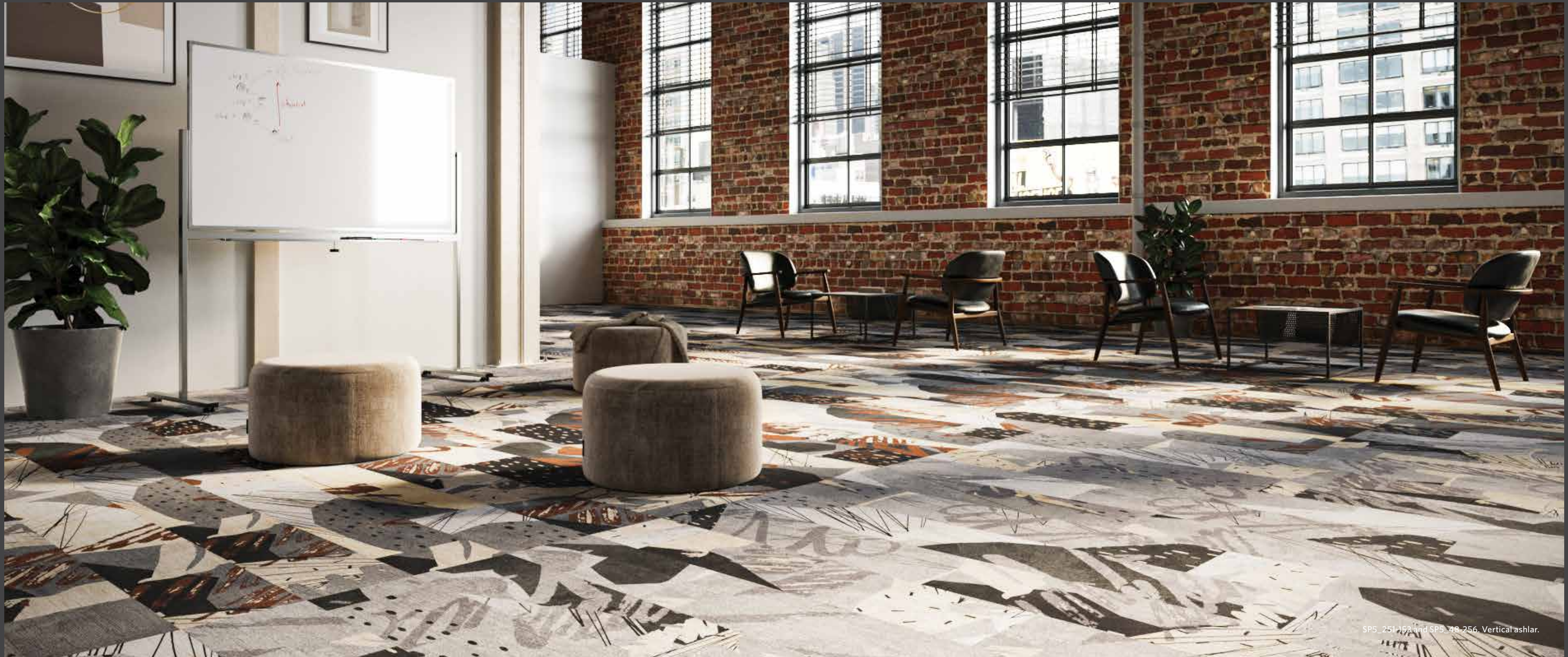
SP5_251-153 and SP5_48-256. Vertical ashlar.