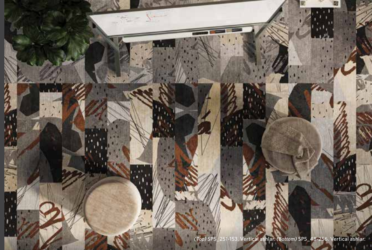
(Top) SP5_251-153. Vertical ashlar. (Bottom) SP5_48-256. Vertical ashlar.