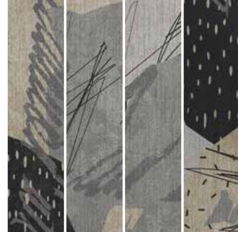
SP5_251-153 25 cm x 1 m planks