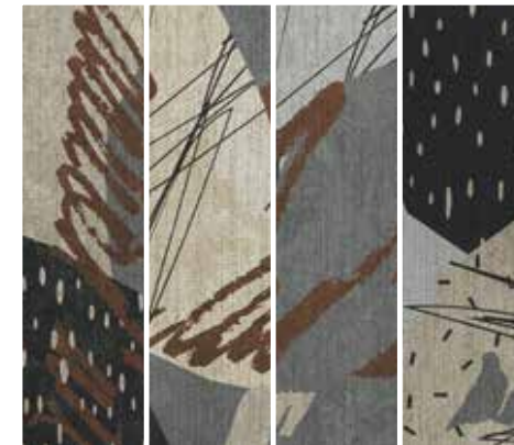
SP5_48-256 25 cm x 1 m planks