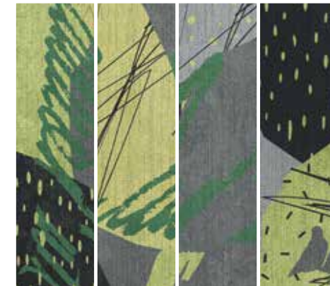
SP5_119-266 25 cm x 1 m planks