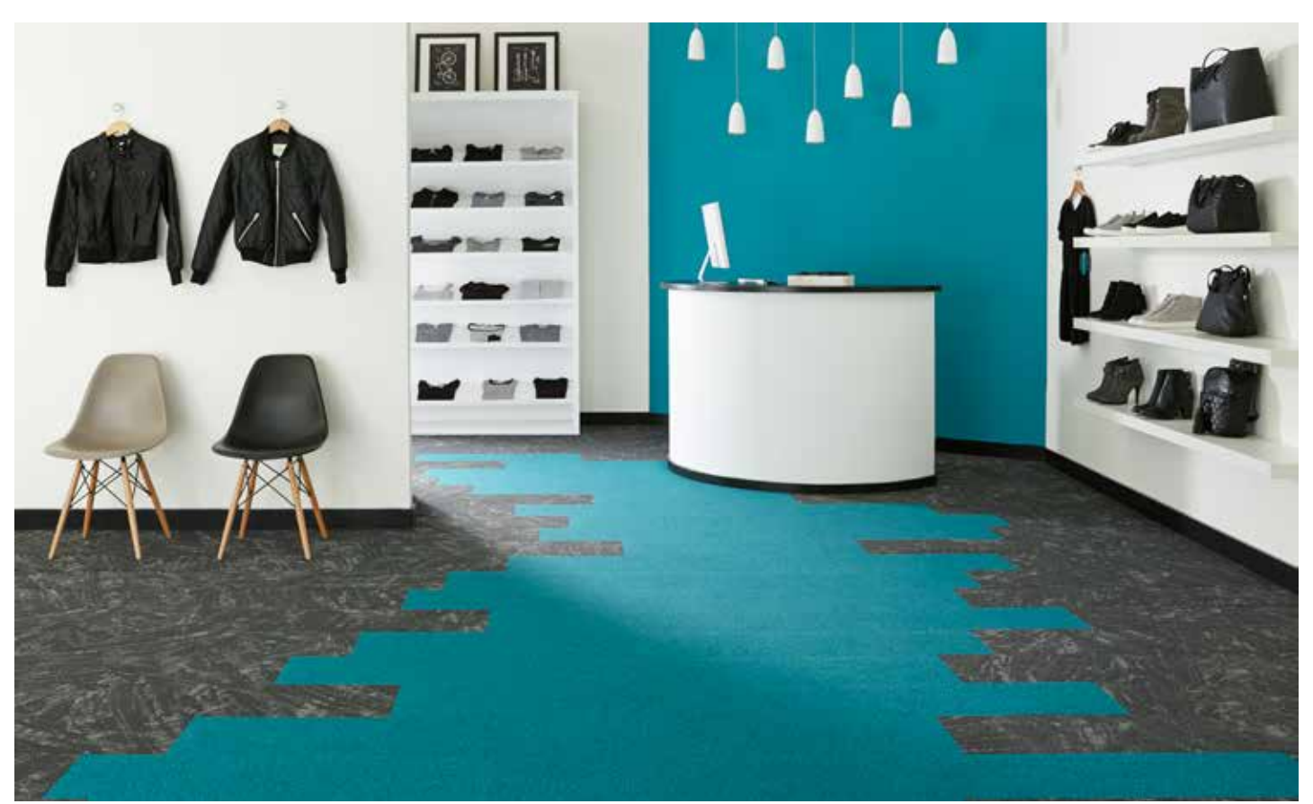
Formwork in Aquamarine with Talus in Galena, 25cm x 1m ashlar planks