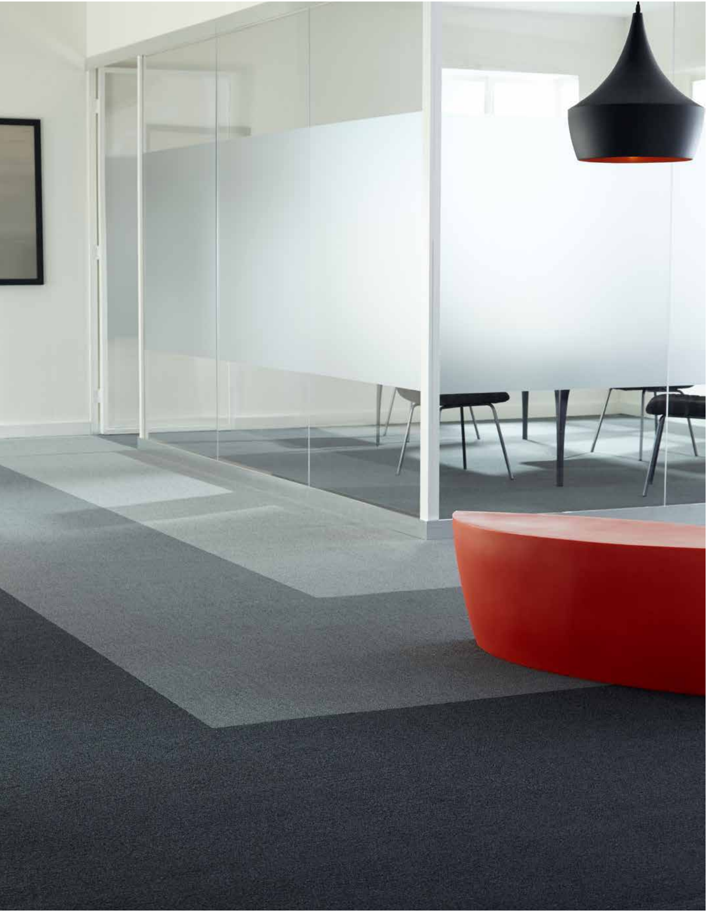
Formwork in Gable, Abacus, and Atrium (bottom to top), Abacus in conference room, monolithic tile