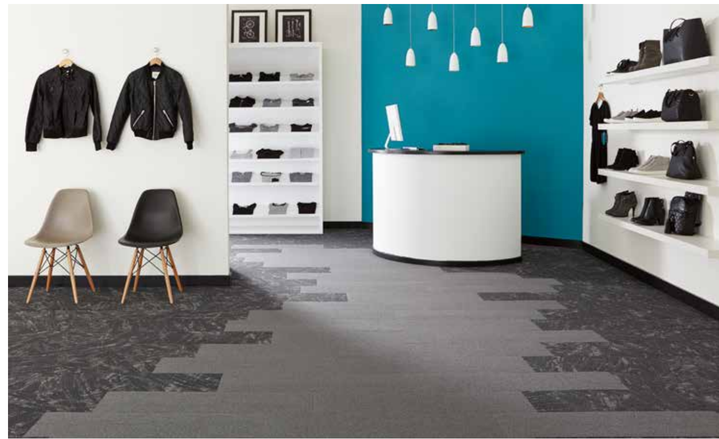
Formwork in Abacus with Talus in Galena, 25cm x 1m ashlar planks