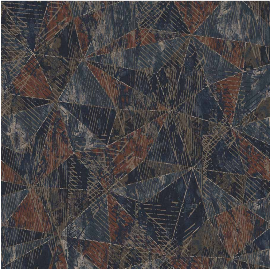
DR#: 01302064 Repeat: 2m x 2m (78.8" W x 78.8" L) 4 Tile Field Shown in Pure Color Attache