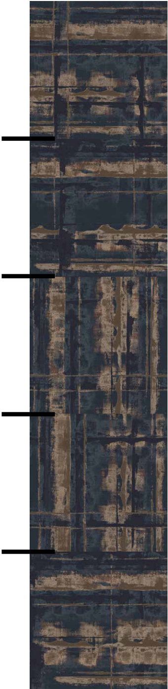
DR#: 01302579 Repeat: 1m x 1m (39.4" W x 39.4" L) 1 Tile Random Field (5 Tiles Shown) Shown in Pure Color Attache