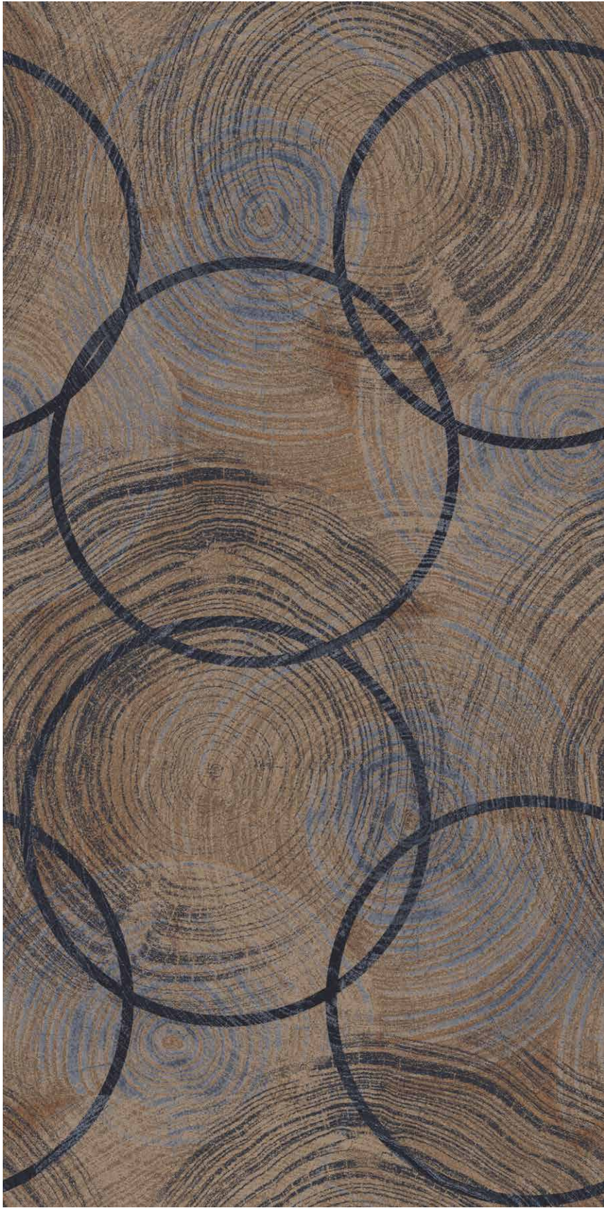
DR#: 01302588 Repeat: 2m x 4m (78.8" W x 157.6" L) Runner Shown in Pure Color Attache