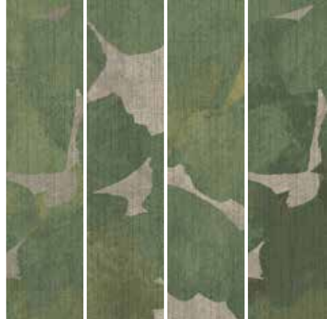
SP6_259-141 25 cm x 1 m planks