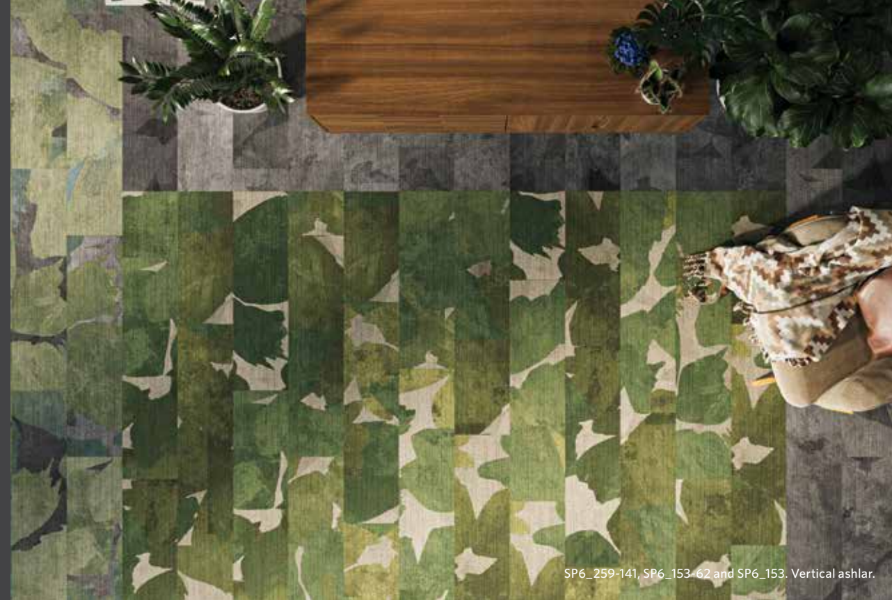
SP6_259-141, SP6_153-62 and SP6_153. Vertical ashlar.