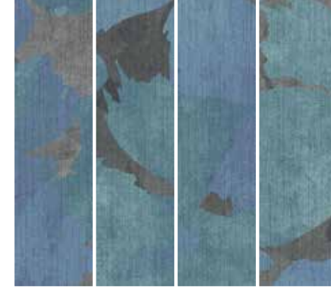
SP6_153-200 25 cm x 1 m planks