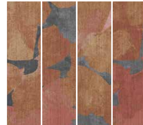
SP6_153-128 25 cm x 1 m planks