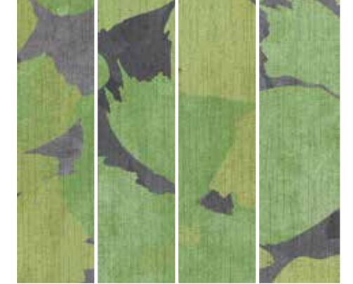
SP6_153-282 25 cm x 1 m planks