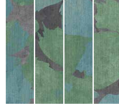
SP6_153-162 25 cm x 1 m planks