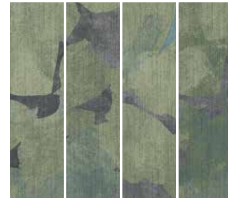
SP6_153-62 25 cm x 1 m planks