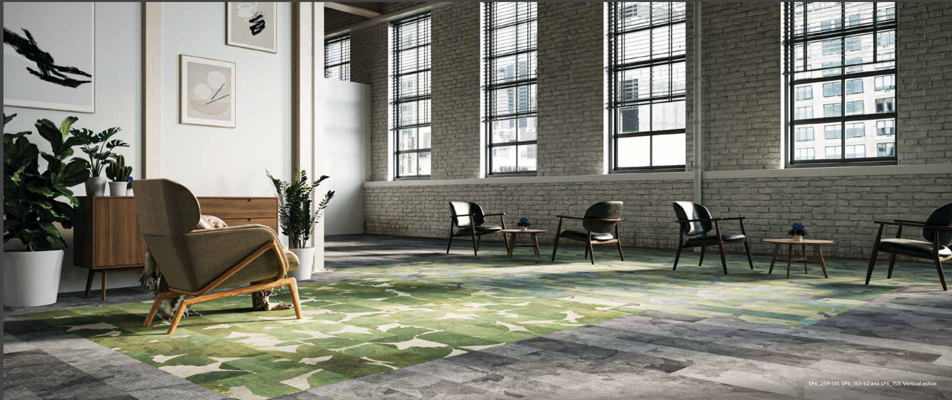
SP6_259-141, SP6_153-62 and SP6_153. Vertical ashlar.