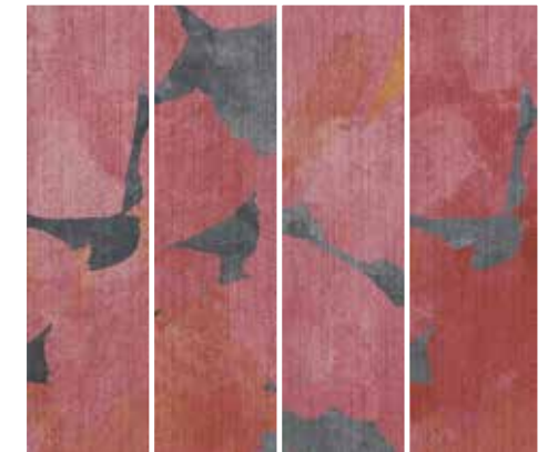
SP6_153-191 25 cm x 1 m planks