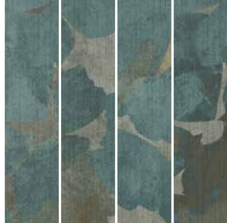
SP6_259-161 25 cm x 1 m planks