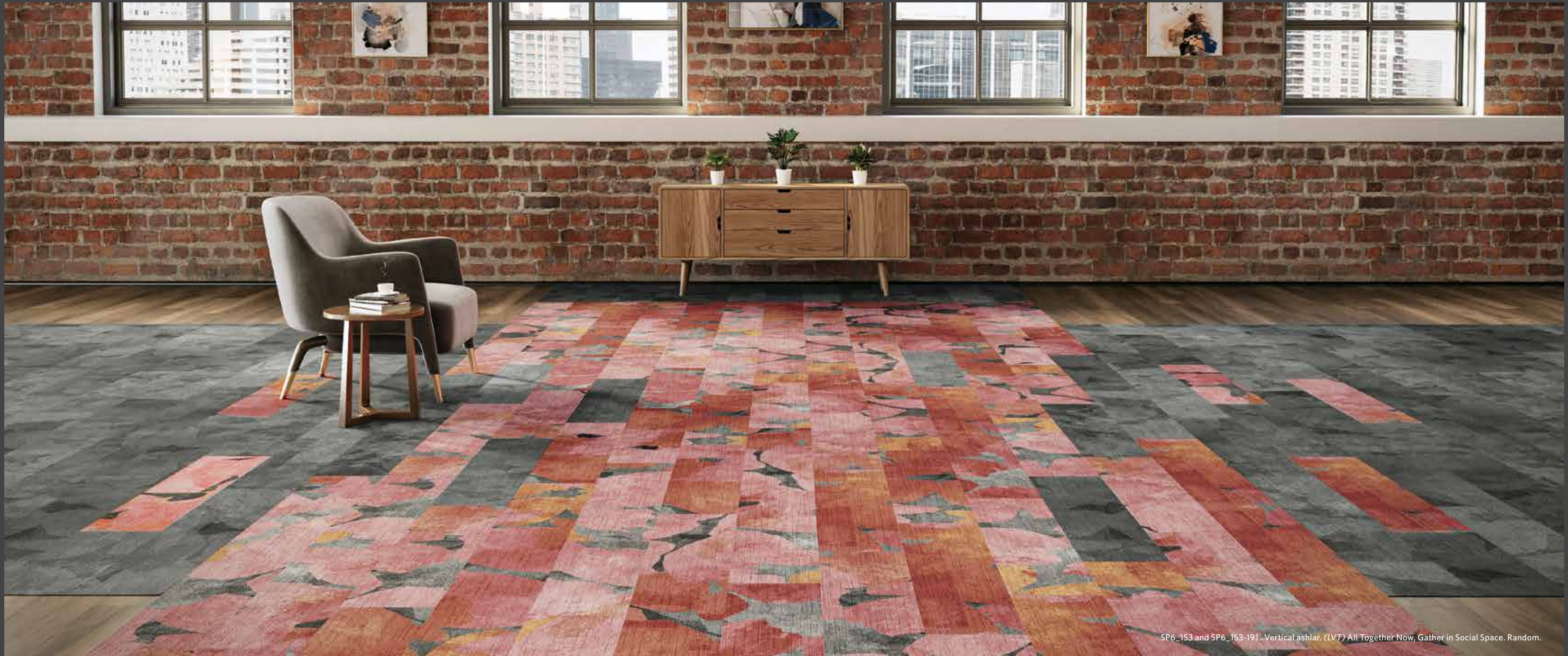
SP6_153 and SP6_153-191 . Vertical ashlar. (LVT) All Together Now, Gather in Social Space. Random.