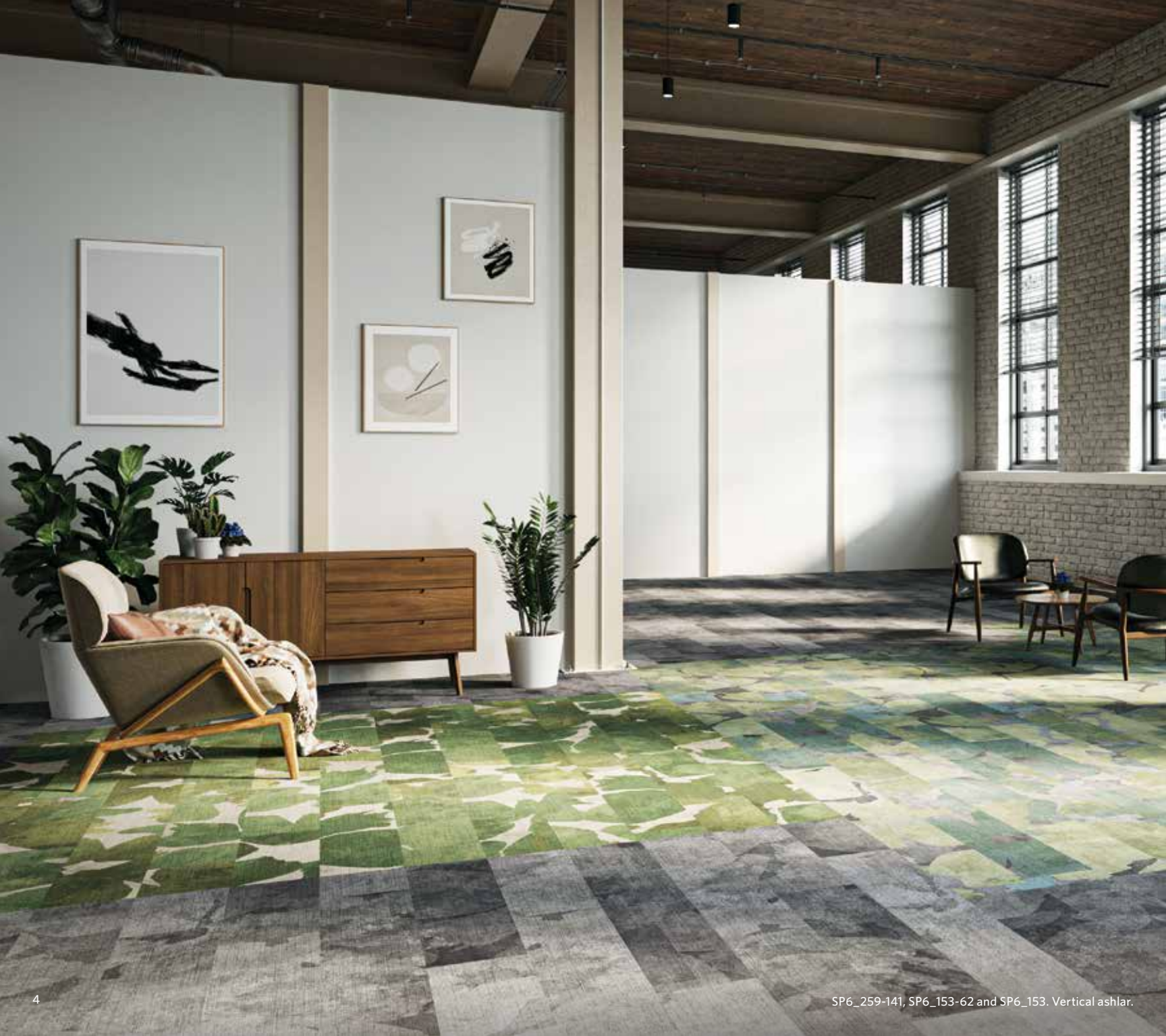
SP6_259-141, SP6_153-62 and SP6_153. Vertical ashlar.