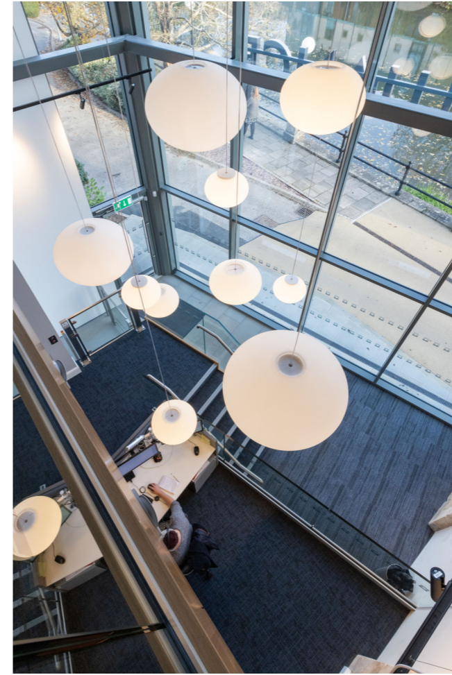
OBEX™ Tile Entrance Flooring and Nordic Stories - Tectonic

The powder coated steel and glass finishes around the large staircase connecting the ground and first floors reference the building's historical heritage. The mesh like structures of Milliken's Tectonic design grounds this space in the slate blue greys of Rock Powder and works beautifully set against these robust industrial materials. Thanks to the product's solution dyed nylon construction, the colours are rich, saturated and render the carpet inherently stain resistant. The floor covering's statement colours throughout the building reflect and reinforce Alliance's brand identity.