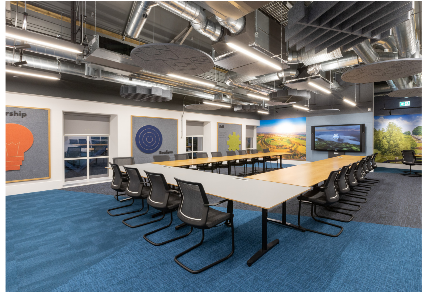
Carpet : Nordic Stories - Hidden Plains and Tectonic

The shifting linear shades of Hidden Plains lead you into the break-out and collaborative working spaces. Once again, the offset positioning of the furniture and carpet zones inject energy and vibrance into these more interactive areas inspiring Alliance's employees to think more freely and creatively.