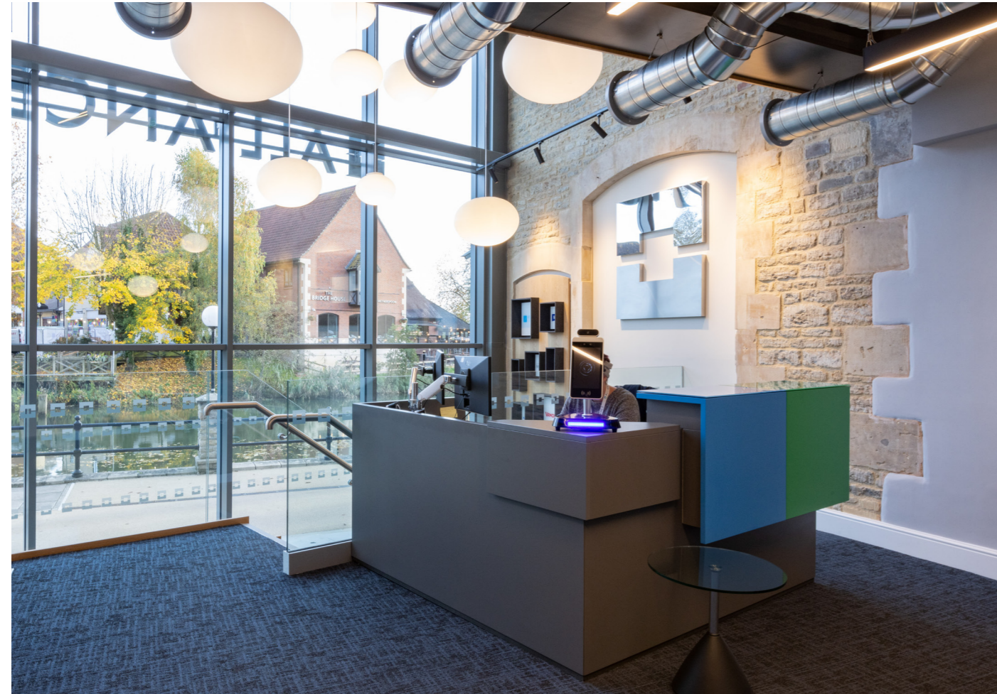
Carpet : Nordic Stories - Tectonic

The Wylde IA design team have created a bright and inviting new office environment that now facilitates a modern, more collaborative workstyle. To achieve the floor covering aesthetic and performance they were looking for, the team chose Tectonic and Hidden Plains from Milliken's classic Nordic Stories modular carpet collection and its OBEX™ protective flooring Tile range.