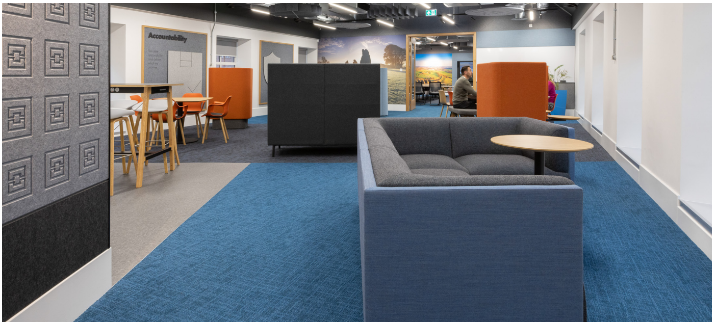
Carpet : Nordic Stories – Tectonic