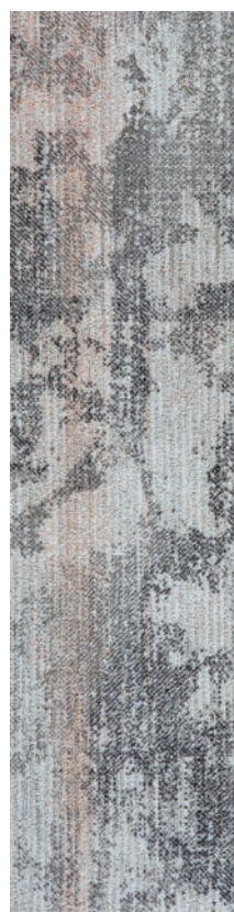
ETG79-261-144 Frost | Rose Wash