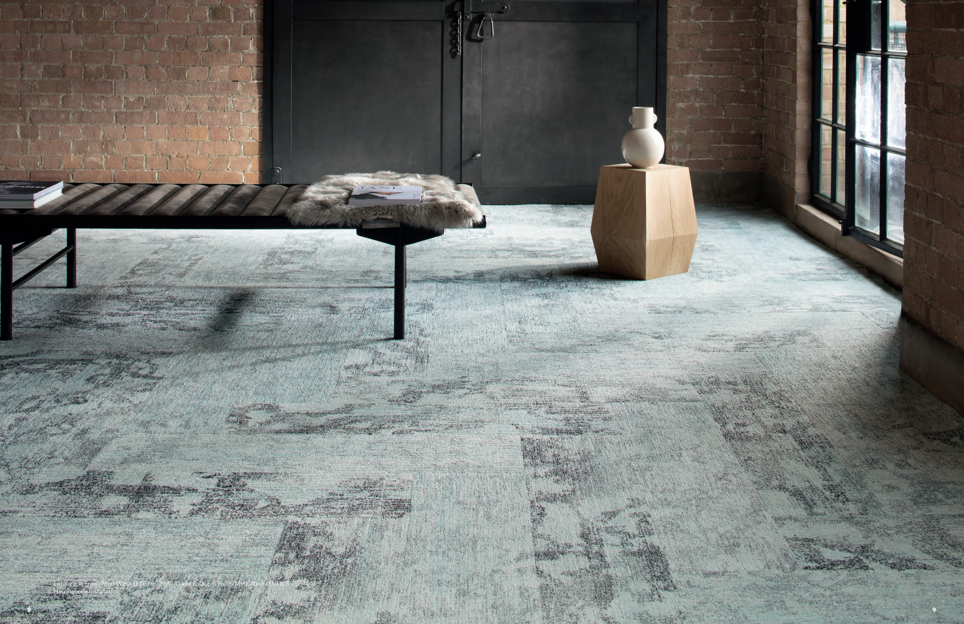
Entangle in Frost/Mint Wash (ETG79-139-144) and Enlace in Frost/Mint Wash (ENL108-139-144) Herringbone Installation