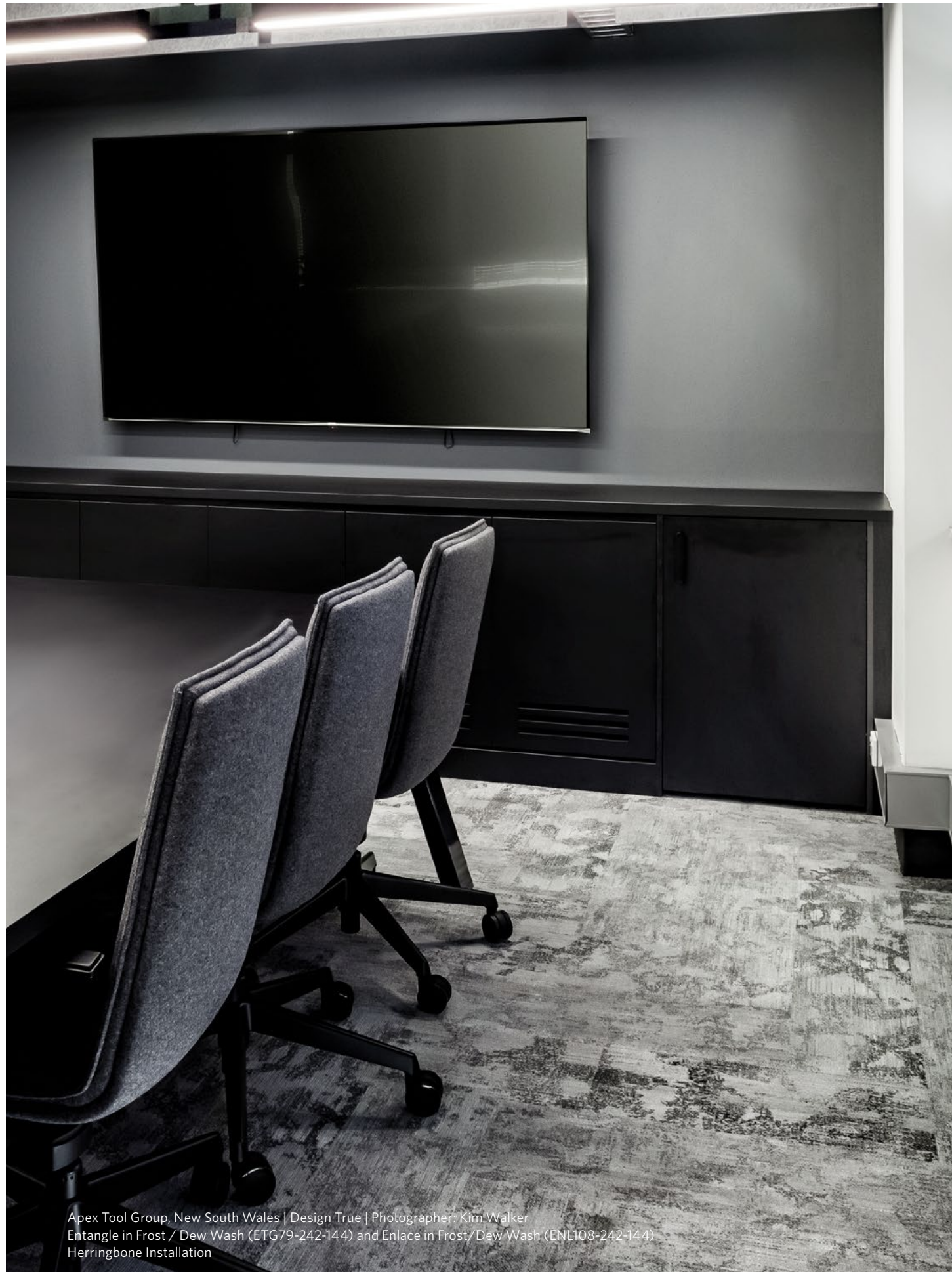
Apex Tool Group, New South Wales | Design True | Entangle in Frost / Dew Wash (ETG79-242-144) and Enlace in Frost / Dew Wash (ENL108-242-144) Herringbone Installation