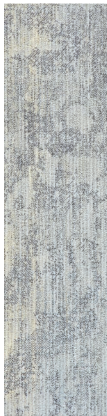
ENL108-217-144 Frost | Oyster Wash