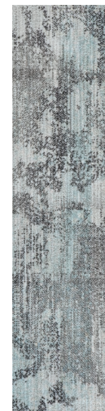
ETG79-139-144 Frost | Mint Wash