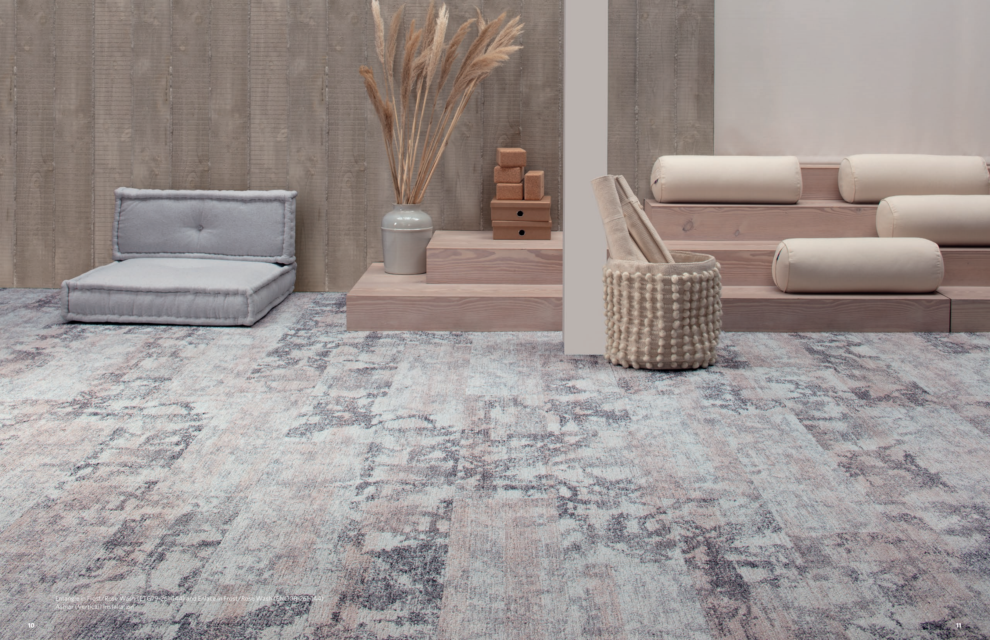
Entangle in Frost/Rose Wash (ETG79-261-144) and Enlace in Frost/Rose Wash (ENL108-261-144) Ashlar (Vertical) Installation