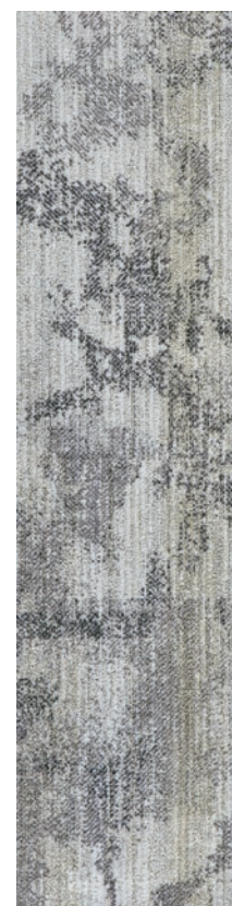
ETG79-37-144 Frost | Cedar Wash