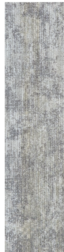
ENL108-37-144 Frost | Cedar Wash