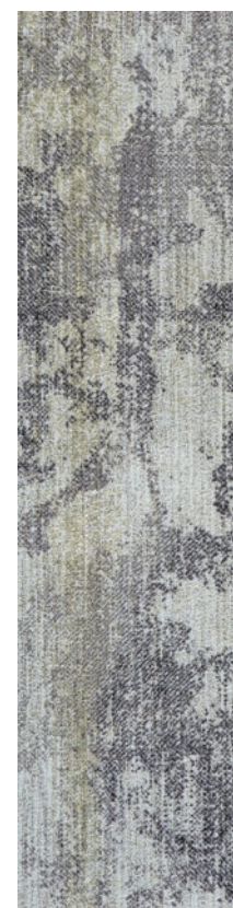
ETG79-21-144 Frost | Laurel Wash