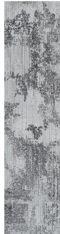
ENTANGLE IN FROST ETG79-144