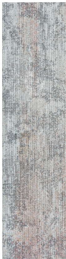
ENL108-261-144 Frost | Rose Wash