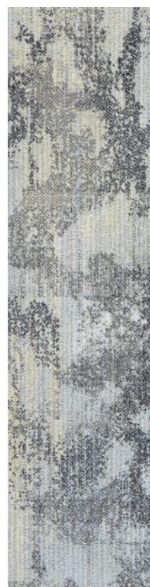
ETG79-217-144 Frost | Oyster Wash