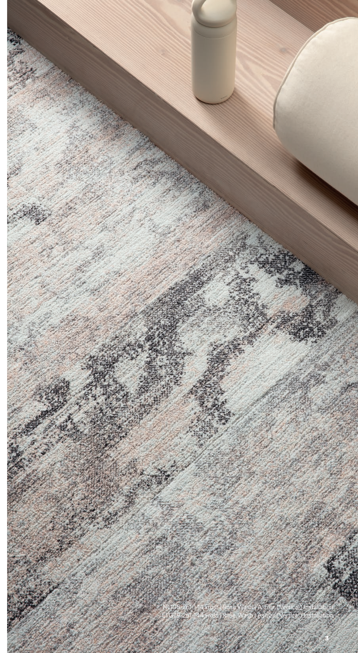
NL108-261-144 Frost | Rose Wash | Ashlar (Vertical) Installation ETG79-261-144 Frost | Rose Wash | Ashlar (Vertical) Installation