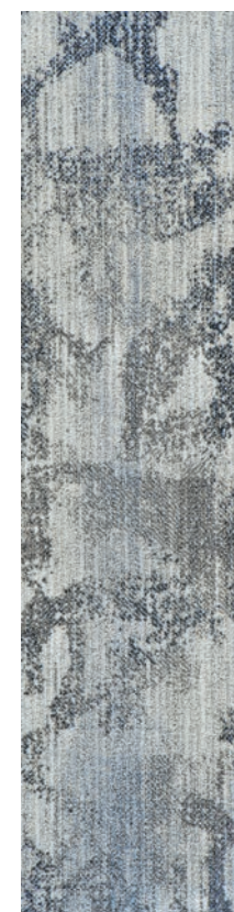
ETG79-242-144 Frost | Dew Wash