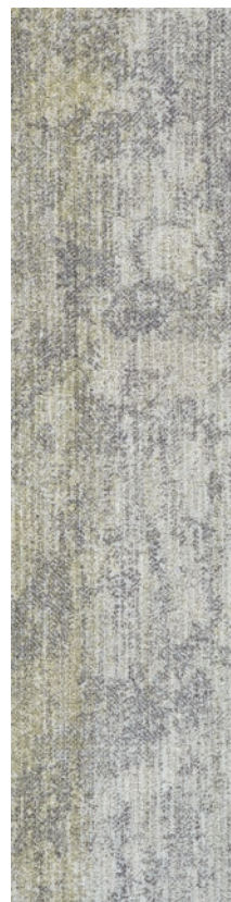
ENL108-21-144 Frost | Laurel Wash