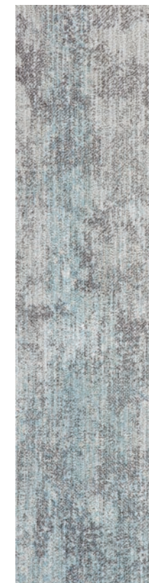
ENL108-139-144 Frost | Mint Wash