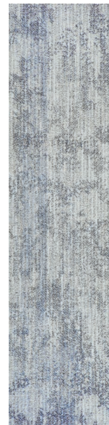
ENL108-242-144 Frost | Dew Wash