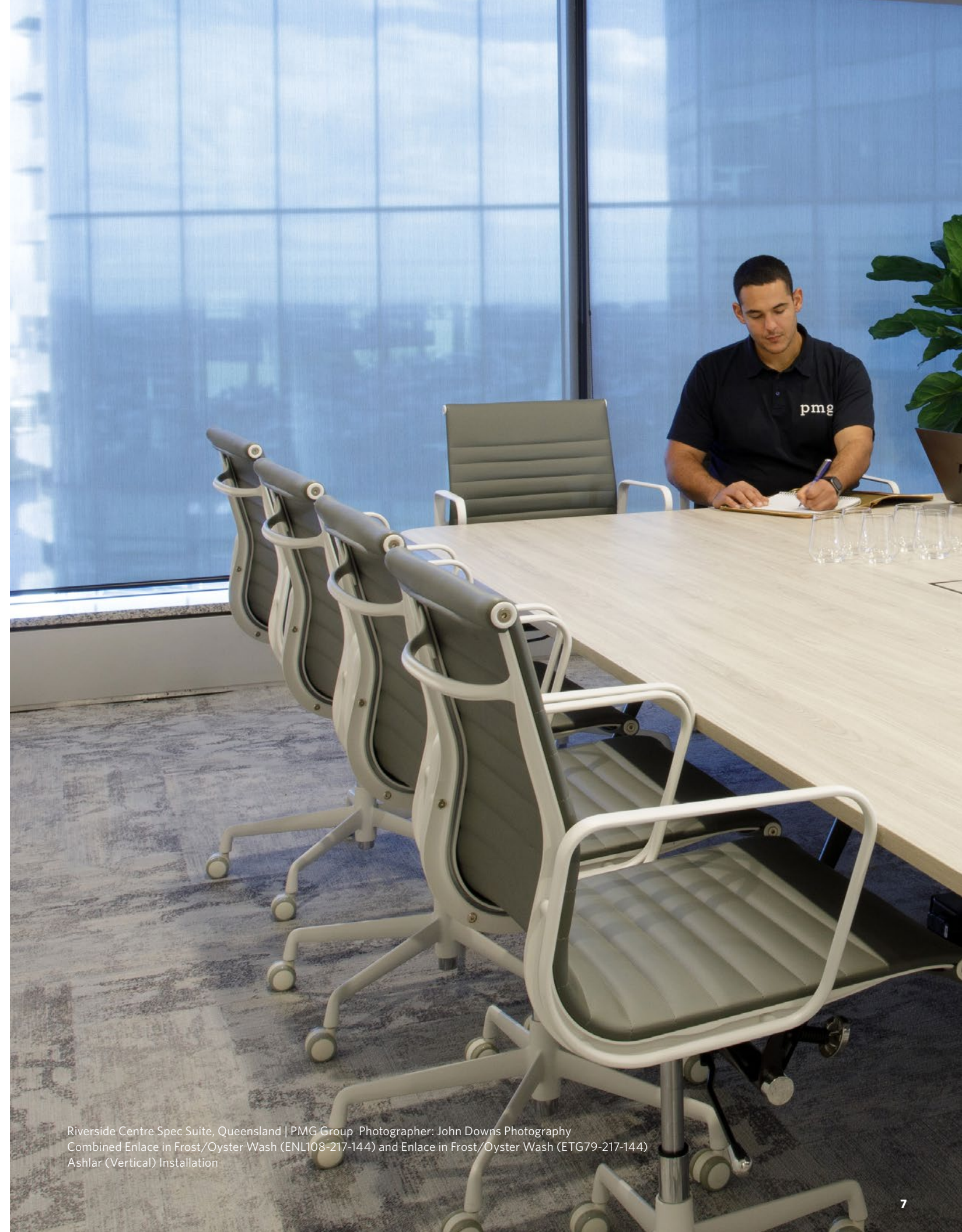
Riverside Centre Spec Suite, Queensland | PMG Group | Combined Enlace in Frost / Oyster Wash (ENL108-217-144) and Enlace in Frost / Oyster Wash (ETG79-217-144) Ashlar (Vertical) Installation